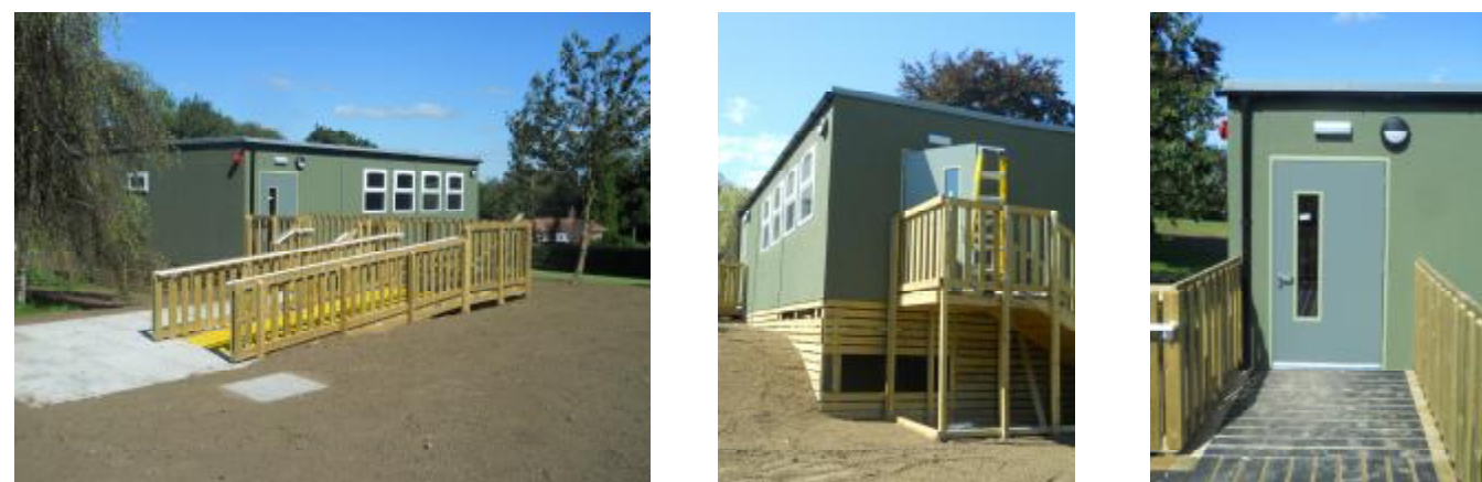
Figure 2 – Typical Images of a temporary classroom. Proposed temporary classroom to be of similar appearance.