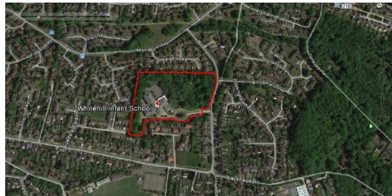
Figure 2 - Aerial photograph of the school site and surrounding area.

The proposed building is to be sited on an area of grass land adjacent to the main school building on the eastern side of the site. The piece of land chosen to receive the building is principally vacant, with it used as an outdoor play space on occasions. The school have identified this area as an ideal location as it will ensure no loss of important play space elsewhere.